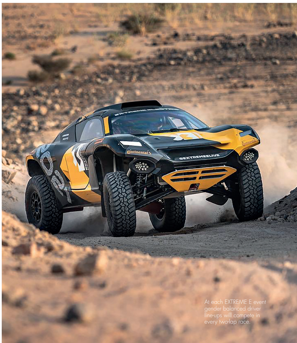
At each EXTREME E event gender balanced driver line-ups will compete in every two-lap race.