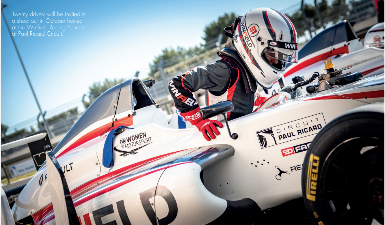
Twenty drivers will be invited to a shoot-out in October hosted at the Winfield Racing School at Paul Ricard Circuit.