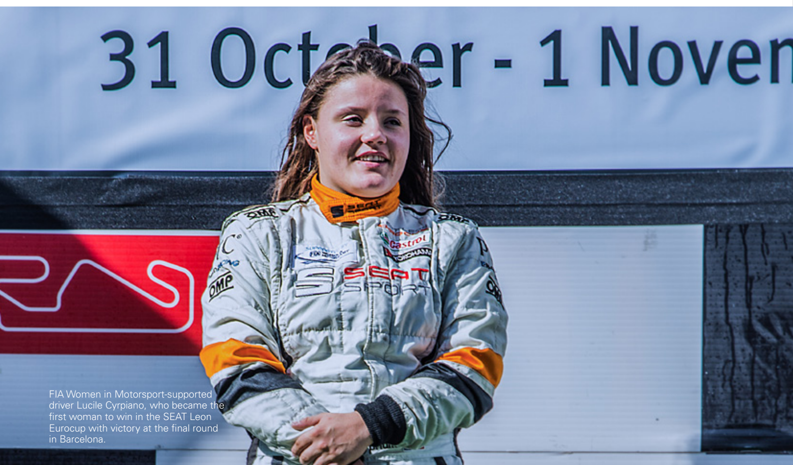
FIA Women in Motorsport-supported driver Lucile Cypriano, who became the first woman to win in the SEAT Leon Eurocup with victory at the final round in Barcelona.

It's our duty to create and maintain an equal system in which both men and women have the same chance to progress in their professional lives.